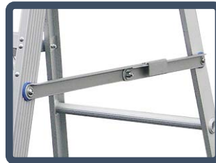
Heavy Duty Spreader Bar