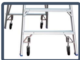
Optional Wheel Kits