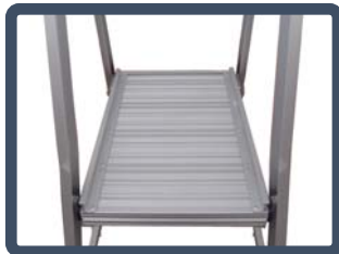
Large Anti Slip Work Platform